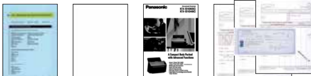
Binary / Color

Detection of questionable image quality after scanning, by providing four unique functions for detection.