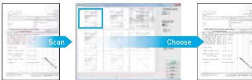
Click and save the most suitable image from 9 candidates.

Easily adjust scan settings while viewing the current scanned image data.